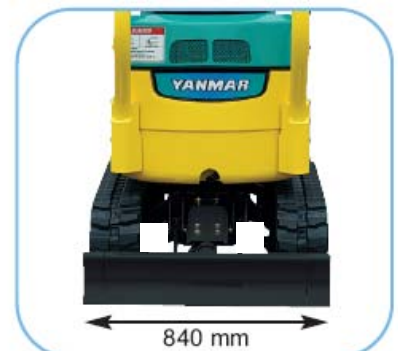
Extended undercarriage for better stability