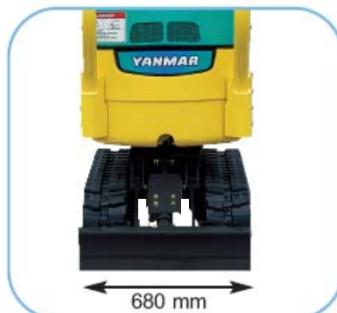
Retracted undercarriage to allow easier manoeuvre through obstacles